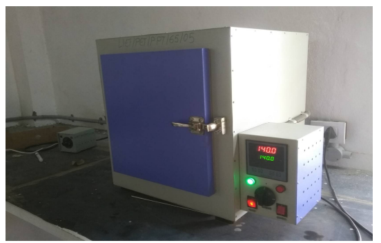
Figure 4: Copper strip apparatus

The apparatus we used is copper strip corrosion test apparatus. It is actually an Owen where we can change the temperature for the experiment. The apparatus consists of a boiling bath (100°C only) without stainless steel bomb and copper strips of definite size 6 bombs or 18 test tubes can be accommodate in each type of bath with different temperature regulation system to operate on 220 volts AC mains.